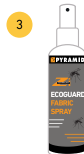
Fabric sprays containing an insecticide