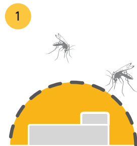
Treated mosquito nets