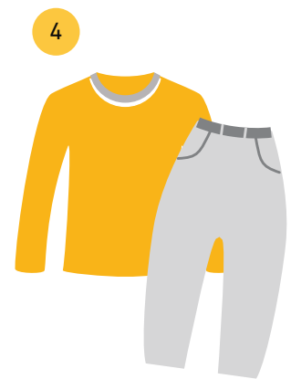
Loose, long-sleeved clothing in light coloured fabric